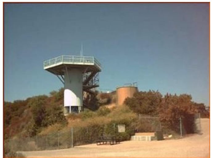
Old Nike missile radar site, top of San Vicente Mountain, 1999

Chet looked up and saw clearly that it was not a helicopter. It made absolutely no sound. He saw that all three of them were bathed in a very intense bluish-green light. The light was not at all like a beam of light, as it was extremely bright, lighting up a large area and making visible the surrounding grasses and shrubs.